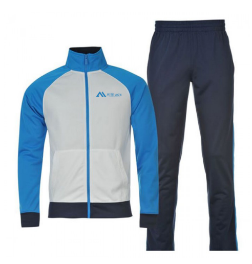
Track Suit AI-04-506

Small, Medium, Large, X Large, XX Large, XXX Large