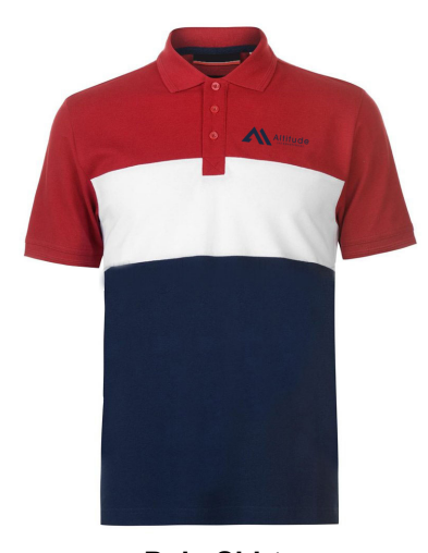
Polo Shirt Al-04-807

Polo shirt Fold over collar 3 button fastening placket Short sleeves Lightweight Stripe design Embroidered logo 100% cotton Machine washable Available in Any Color & All Size As Per Custome Small, Medium, Large, X Large, XX Large, XXX Large