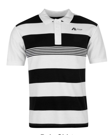
Polo Shirt Al-04-801

Get a comfortable and stylish look with the Polo Shirt, designed with a three button placket, fold down collar,