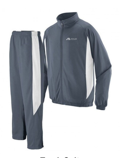
Track Suit AI-04-505

Track suit micro twill 100% polyester with mesh lining. Zaradi international is a best manufacturing company of the highest quality sports track suit Initial orders have12 piece minimum. Standard delivery time i Small, Medium, Large, X Large, XX Large, XXX Large