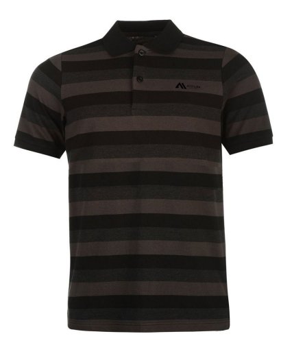
Polo Shirt Al-04-808

Polo shirt Fold over collar 3 button fastening placket Short sleeves Lightweight Stripe design Embroidered logo 100% cotton Machine washable Available in Any Color & All Size As Per Custome Small, Medium, Large, X Large, XX Large, XXX Large